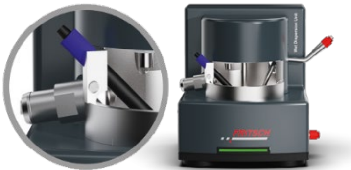
Fig 3: Laser Particle Sizer ANALYSETTE 22 NeXT Wet Dispersion Unit with pH module.

The newly introduced combination of particle size analysis and pH measurement by FRITSCH, which has been patented in the meantime, picks up on the importance of the pH value for optimal dispersion. Due to the modular design of the FRITSCH Laser Particle Sizer ANALYSETTE 22 NeXT, the new pH module can now be added to the wet dispersion unit for the determination of the particle size distribution of suspensions and emulsions by means of laser diffraction according to ISO 13320 for relevant samples (Figure 3). By means of a unidirectional interface, values from the pH meter can be transferred directly to the software of the ANALYSETTE 22 NeXT via an SOP command. This enables an exact determination of the pH value of the sample bath both before, during and also after the dispersion process.