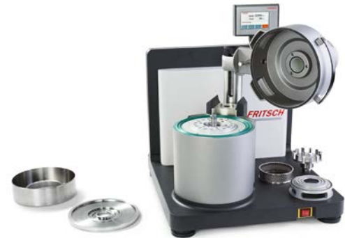
Fig.. 1: FRITSCH Variable Speed Rotor Mill PULVERISETTE 14 premium line

A never before achieved fineness with a centrifugal mill is attained in a short amount of time with the new FRITSCH PULVERISETTE 14 premium line (fig. 2). This became possible because the rotor peripheral speed was increased by more than 20% up to 110m/s, in comparison to instruments to date. A higher fineness is interesting in many aspects: Since many materials change their characteristics and their effects on the organism depending on the particle size, this is interesting for example in the area of exploration of new active components of pharmaceutical products.