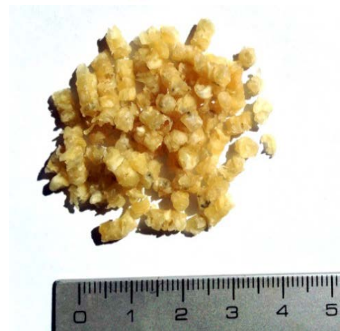
Fig. 3: Basic material: dried, pre-crushed mushrooms

An example from the industry of food and life science impressively shows the difference between established instruments to date (for example the PULVERISETTE 14 classic line ) and the PULVERISETTE 14 premium line . With the PULVERISETTE 14 premium line dry mushrooms were comminuted (fig. 2) double as fine as it was possible with to date available Centrifugal Mills (fig. 3). The cell walls of mushrooms contain among other things the so called \beta -1,3-glucan, which in vitro and in animals based on in-vivo examinations stimulates the immune system and supports et al. the healing of wounds [1], [2] . Due to a better fine grinding the active component can be extracted more effectively. The familiar cytotoxic effect of \beta -glucan in the course of cancer treatment is based rather on the impurities of the active component, because if instead of the concentrated, pure \beta -glucan was used, no cytotoxic effect was detected [3] .